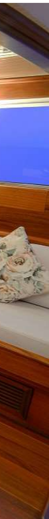
ECCE NAVIGO | Saloon