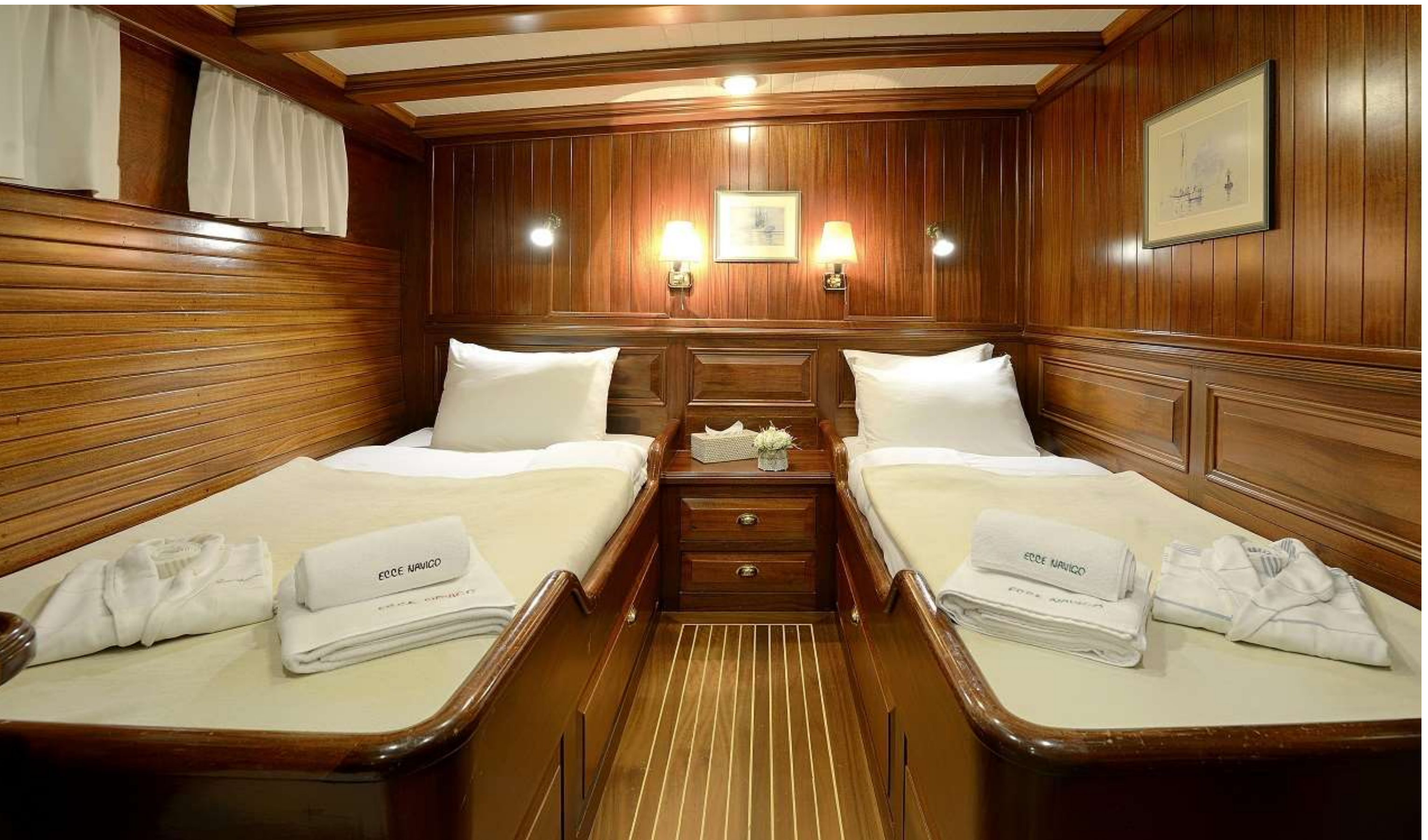
ECCE NAVIGO | Twin Stateroom