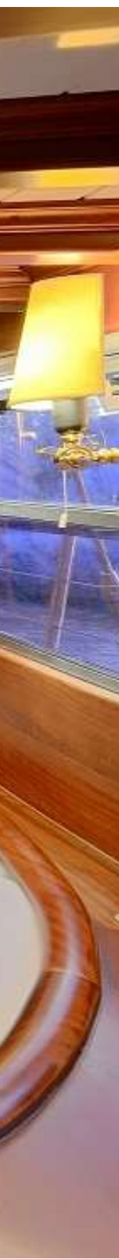
ECCE NAVIGO | Saloon