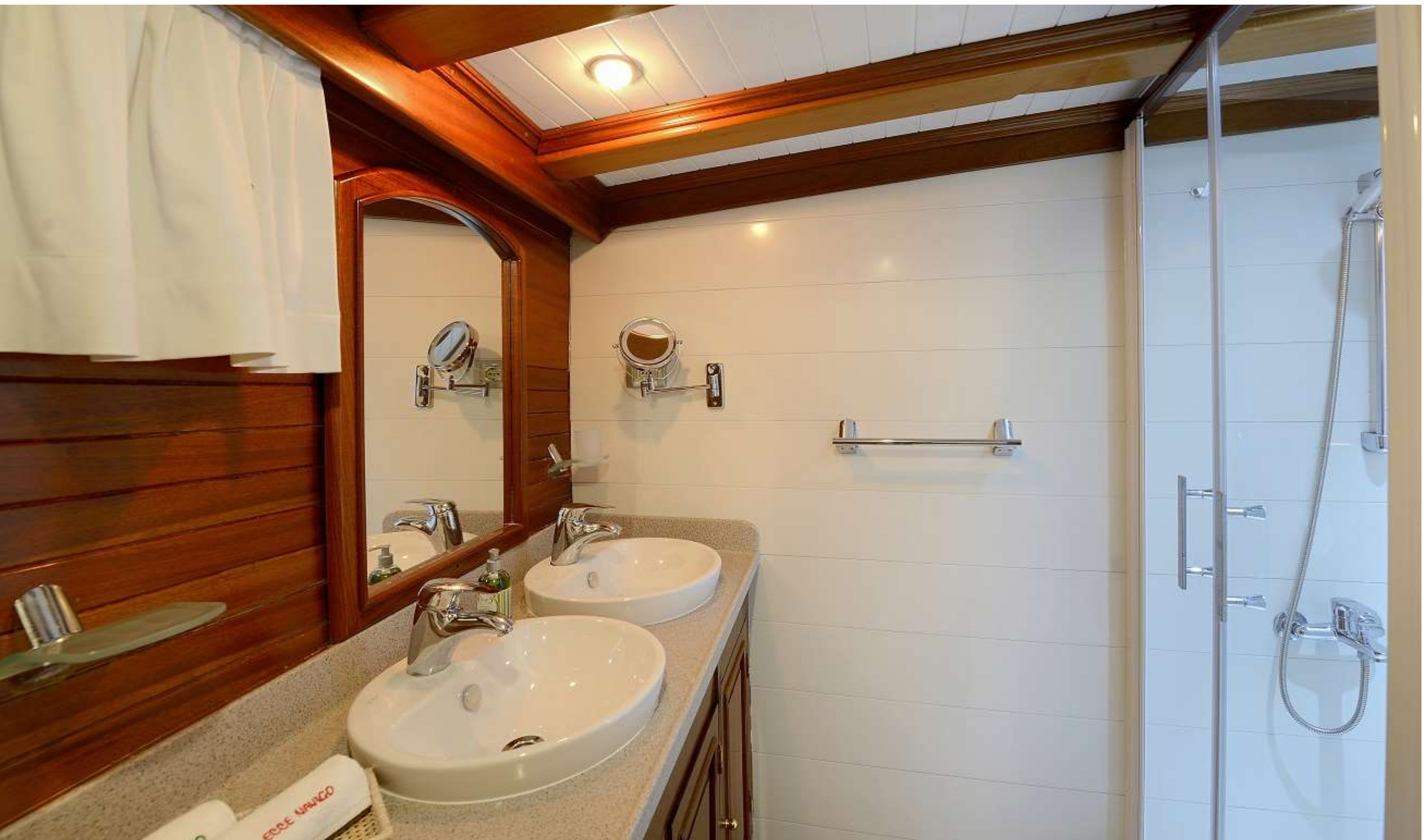
ECCE NAVIGO | Master Stateroom Ensuite