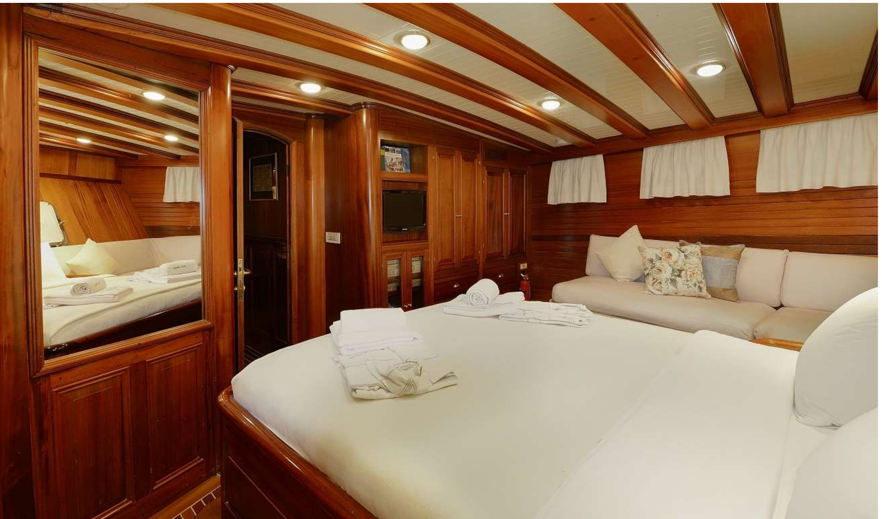
ECCE NAVIGO | Master Stateroom