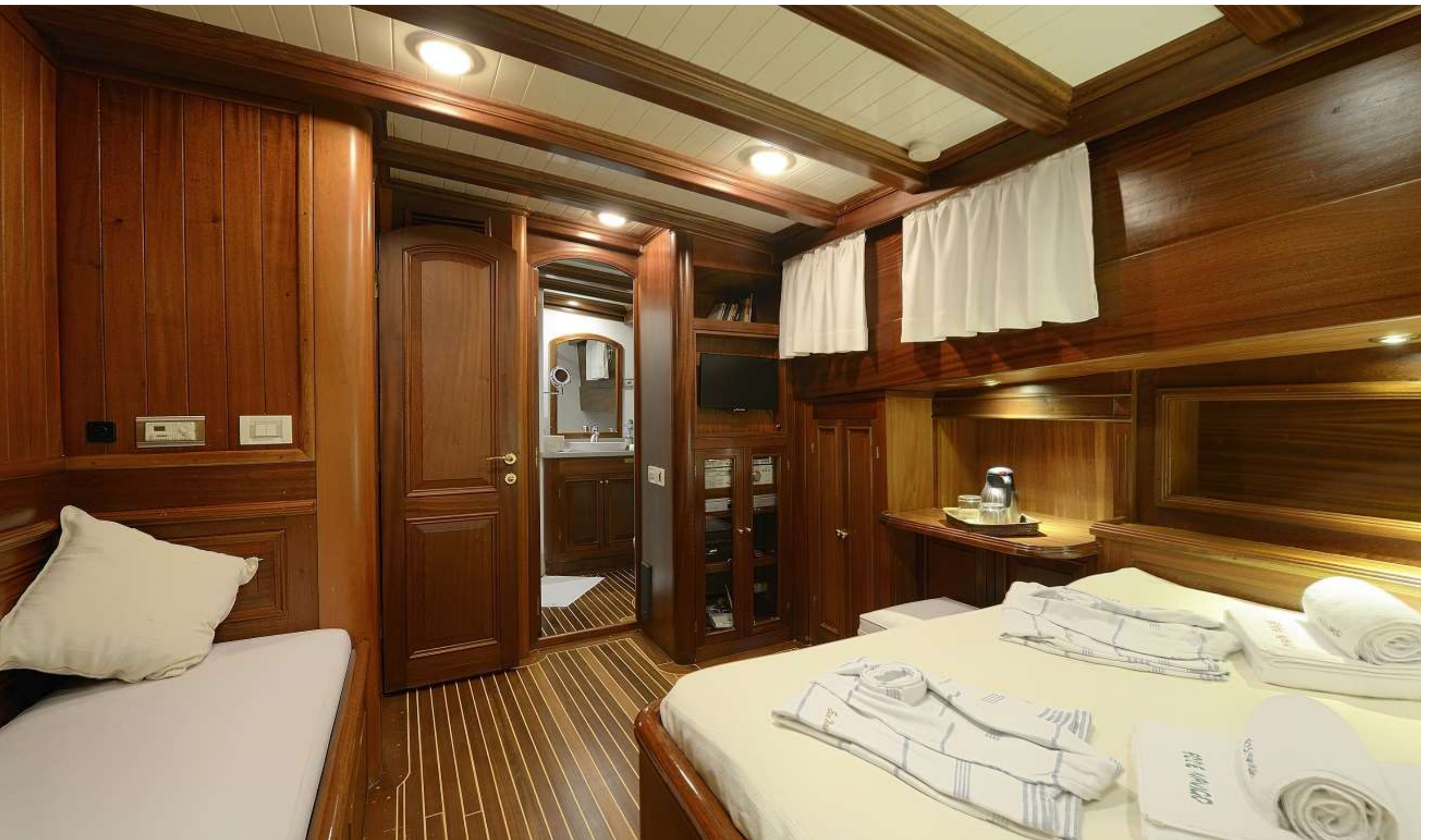
ECCE NAVIGO | Double Stateroom