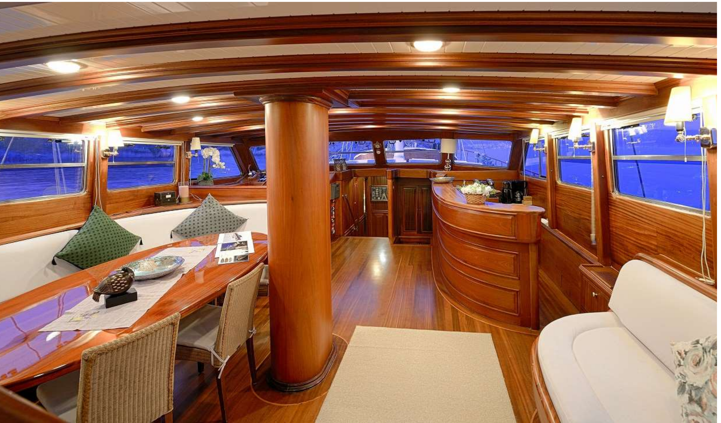
ECCE NAVIGO | Saloon