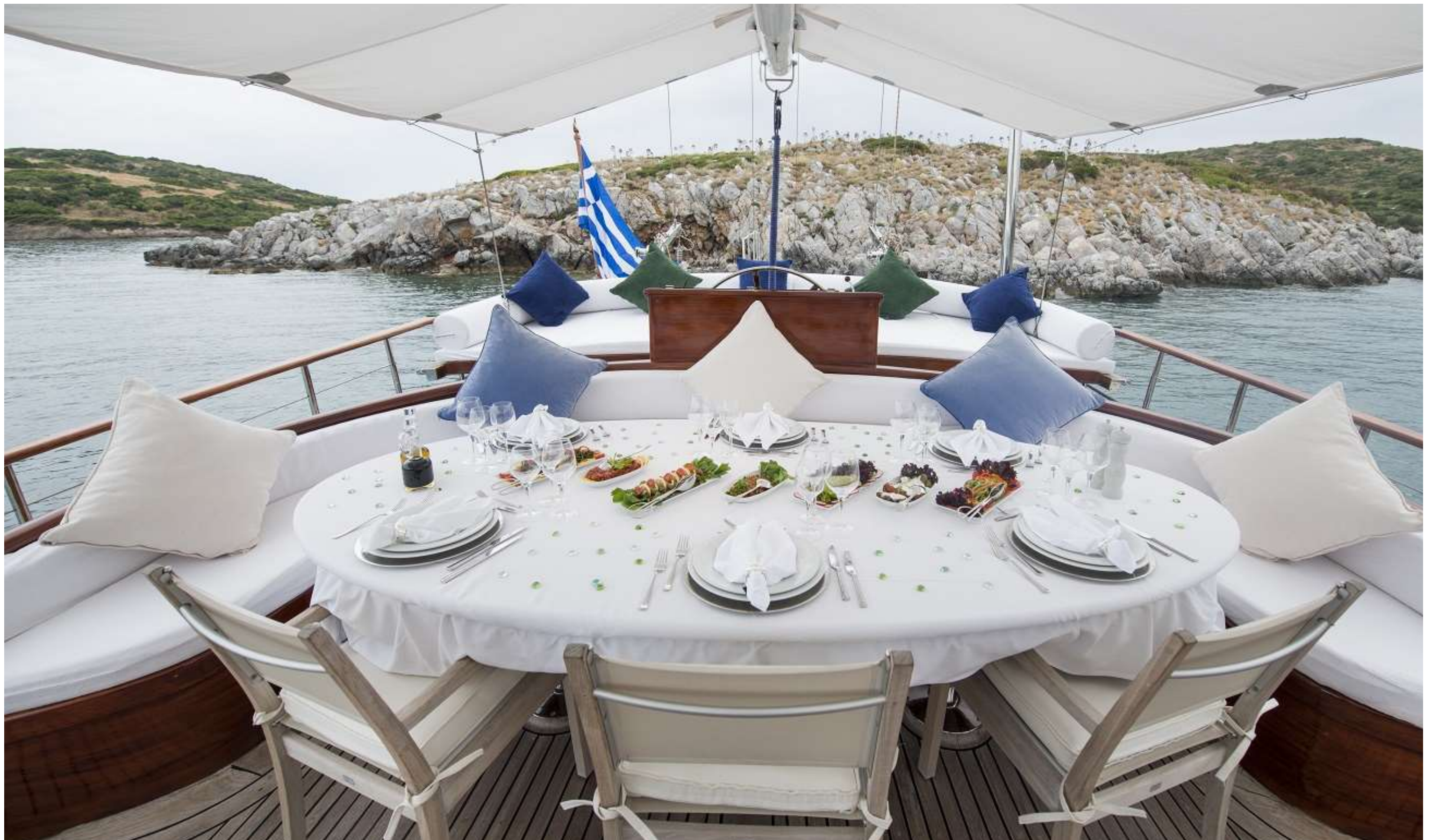
ECCE NAVIGO | Aft Deck