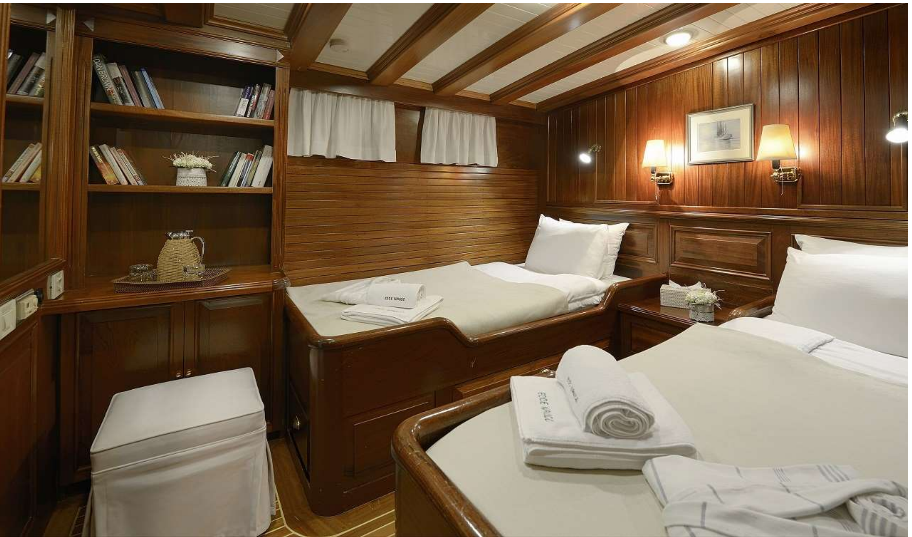
ECCE NAVIGO | Twin Stateroom