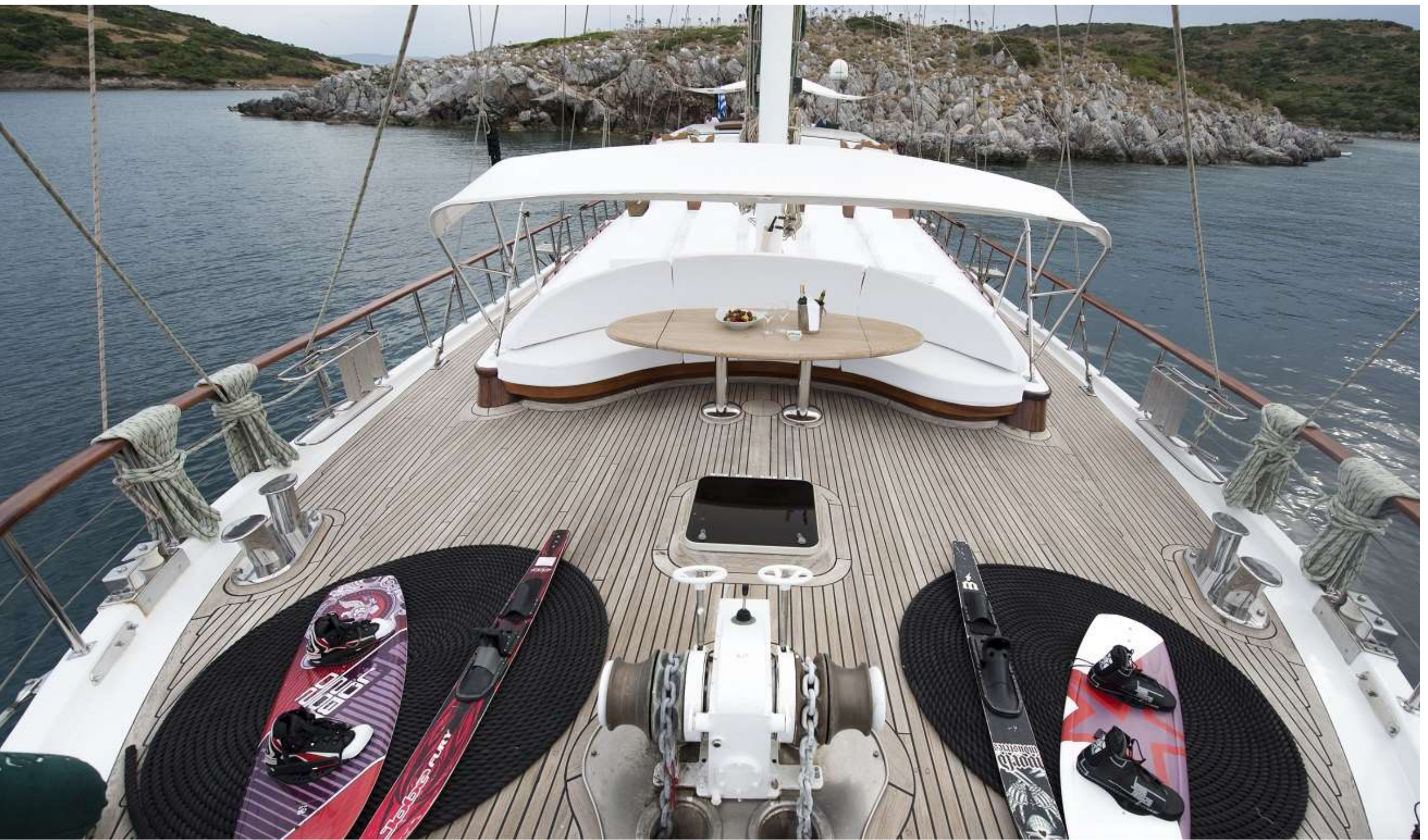
ECCE NAVIGO | Fore Deck