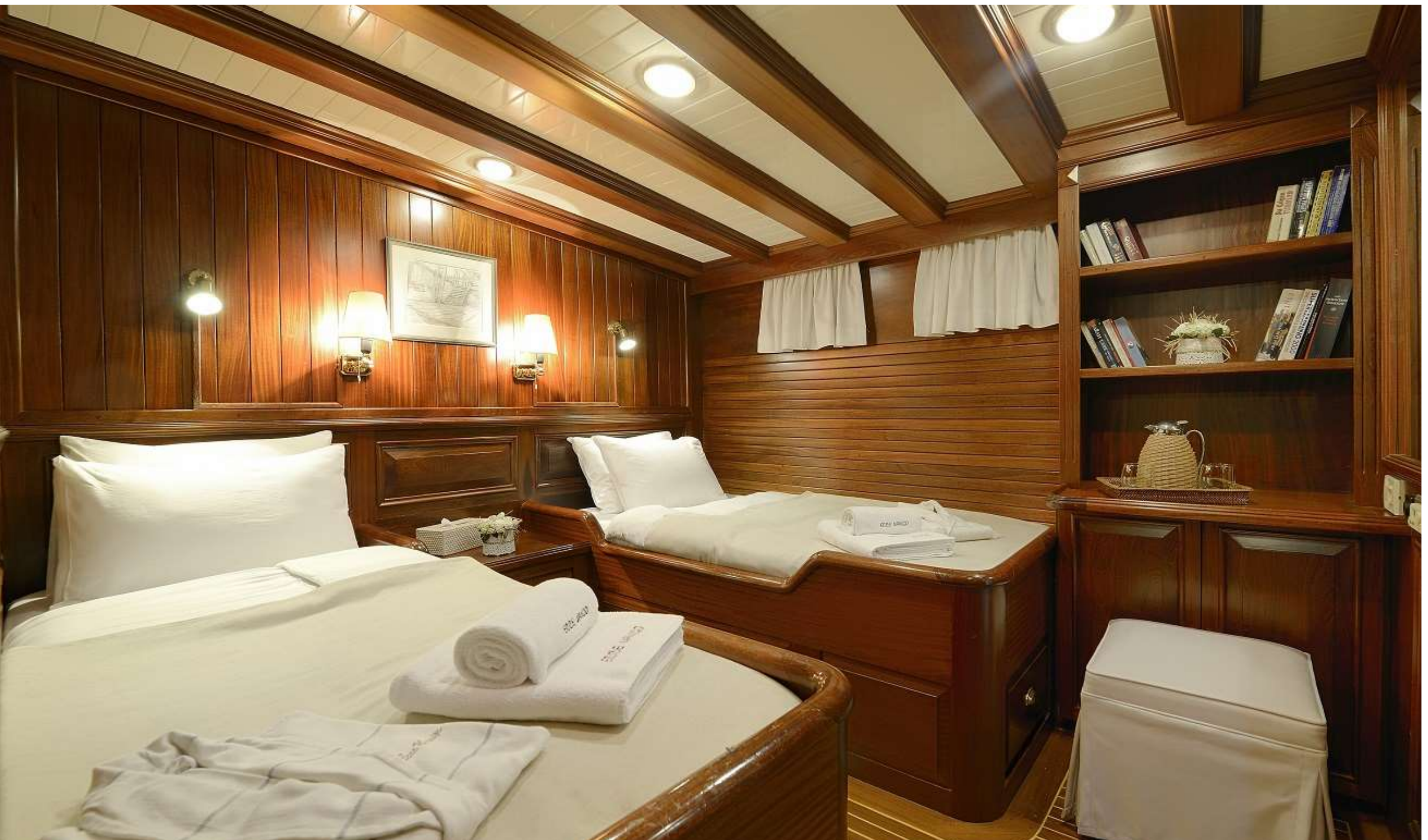
ECCE NAVIGO | Twin Stateroom