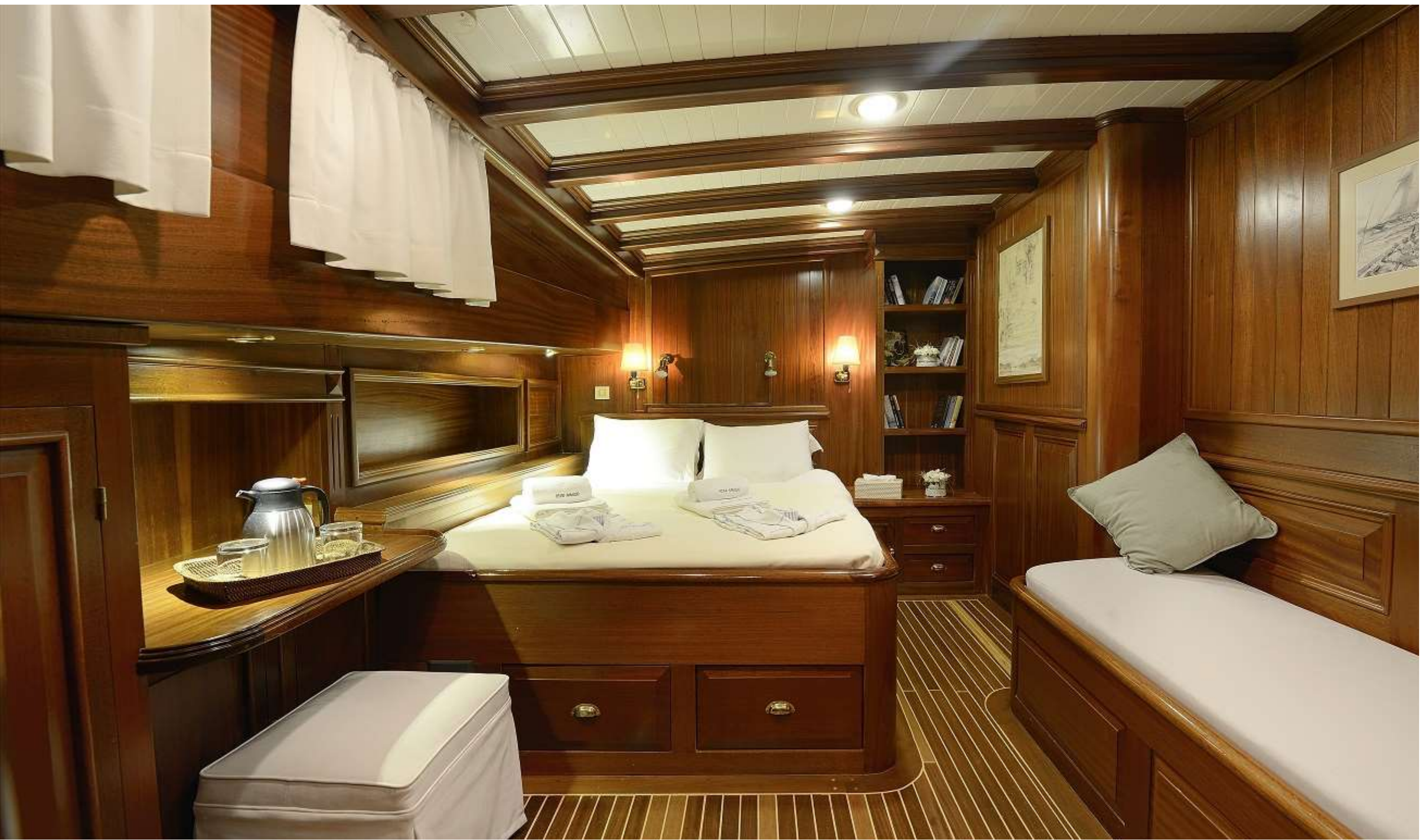
ECCE NAVIGO | Double Stateroom