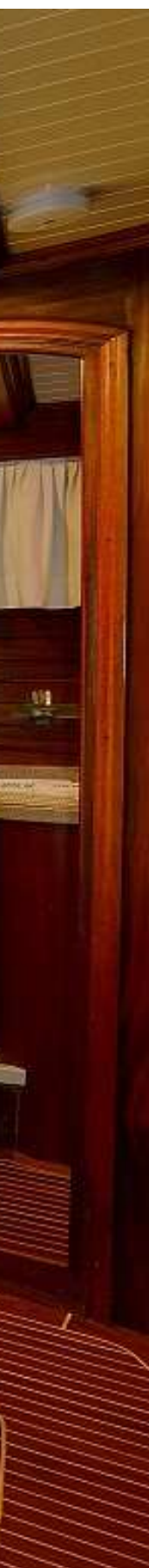
ECCE NAVIGO | Master Stateroom